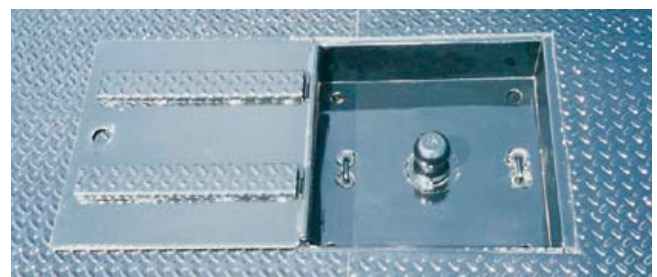
Ball Hitch with Cover Lid