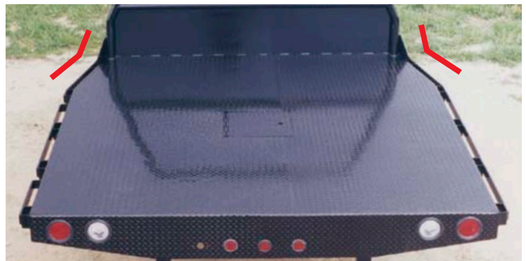
Optional Bull Nose Tapered Front for Better Mirror Vision on 8½' Wide Beds