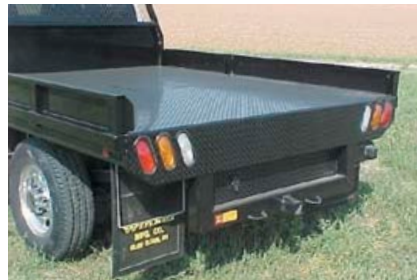
Heavy Duty 3" x 4" Rectangular Tubing Optional Receiver Hitch