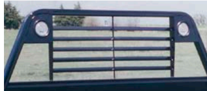
Optional Recessed Light Packages