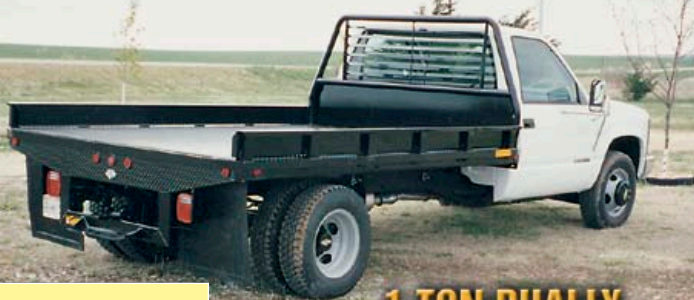
1 TON DUALY